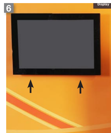
Lock the LCD with the two screws in the bottom of the screen rails!