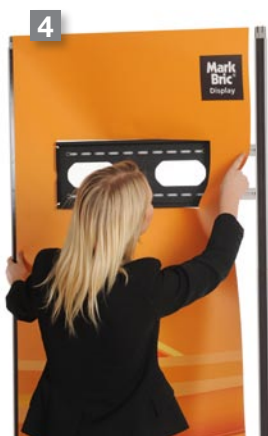
Attach the graphic panels