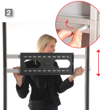
Attach the LCD holder in the system with the 4 FASTclamp locks.