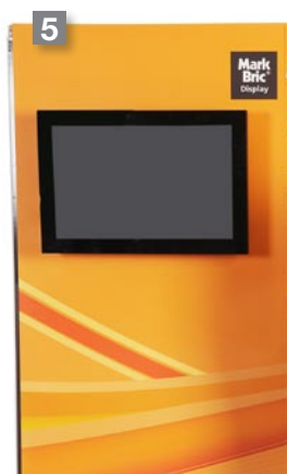
Hook on the LCD