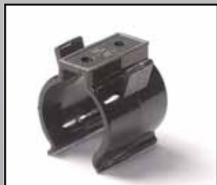
Plastic gripper (for hard panels)