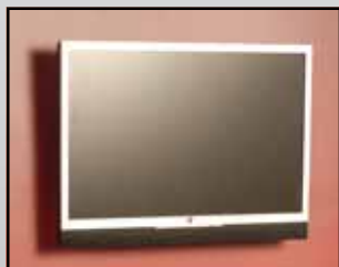
LCD screen holder