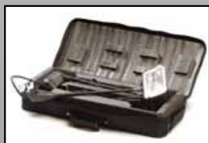
Halogen spotlight, 200W