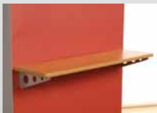
Shelf kit incl. 2 support brackets